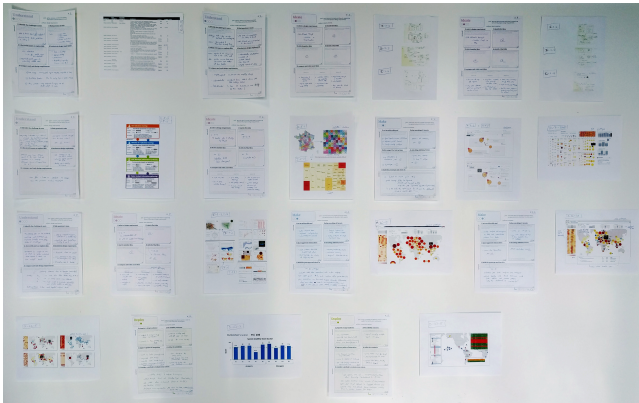
Figure 2: Design worksheet examples. We created example worksheets using linked sketches from our BubbleNet dashboard project [16]. With this example, we taught students visualization design and showcased how a real-world, iterative design process can be captured using the worksheets. A detailed copy of each worksheet and all sketches are included in the Supplemental Materials.

For the cumulative projects, we provided the worksheets in both paper and digital form to all students, but only the 13 volunteers were required to submit digital or scanned copies of their worksheets as part of their project. One student was not part of the original volunteers, but due to complications with her project she reached out to the teaching staff for further help and guidance for visualization design within the context of her project.