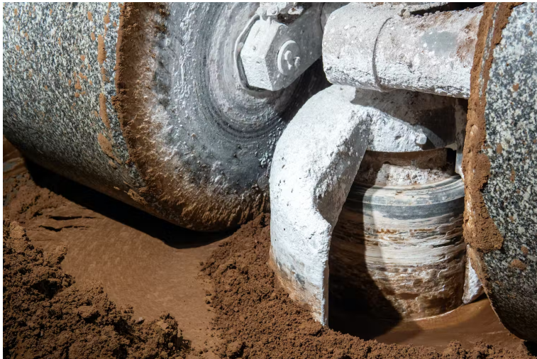
Machines can pulverize the beans to a very fine texture.

After removing the shells and grinding the beans, modern chocolate makers add additional cocoa butter. Cocoa butter is the fat that occurs in the cacao beans. But there isn't enough fat naturally in the beans to make a smooth texture, so chocolate makers add extra.