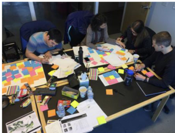
Figure 2. Participants collaboratively brainstorm ideas in a creative-visualization opportunities workshop.

Creative visualization-opportunities (CVO) workshops are a participatory method for eliciting visualization design requirements. These workshops greatly speed up the early stages of a design study, replacing what is typically a lengthy process of interviews and observations with just a few days of focused work. As a team of 5 researchers, we conducted 17 workshops in 10 different projects over a period of about a decade—Figure 2 shows participants collaboratively brainstorming in one of these workshops. Through a meta-analysis of our experiences we developed a framework for planning, running, and analyzing CVO workshops, along with an actionable set of guidelines, pitfalls, and example workshop schedules. 8